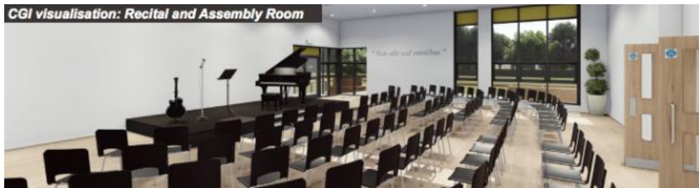
CGI visualisation: Recital and Assembly Room

We are also keen to transition from the virtual to the actual world with a series of events. In particular, a class of 2021 drinks reception will be held at the school on September 1st and subsequently a special event for our former staff and our alumni. If you are able to sponsor any of our events or to offer a venue please do get in touch.