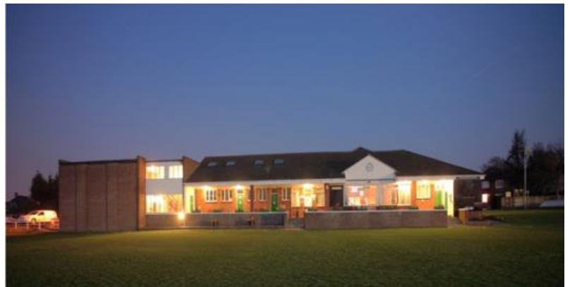
The OWA's Clubhouse at Hayes Hill, lit up in the evening

The Old Wilsonians can truly be described as a 'community club' and as much as we welcome our new intake of local members, we are also keen to attract former members of the school to our ranks - after all, that is what the Association was set up for!