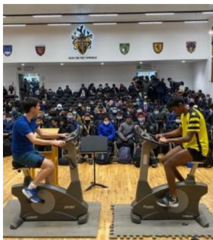
The Headmaster and Head Boy compete against each other racing the final leg

On 7th December 2021, Wilson's staff and pupils took part in a race to raise money for Centrepoint. Starting at 8 o'clock, competitors from the staff and sixth form battled it out, cycling against one another in 20-minute intervals, on stationary bikes set-up in the JJ Hall.