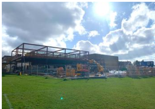
Building work continues at a pace!

2022 promises to be a notable year in the rich history of Wilson's School.