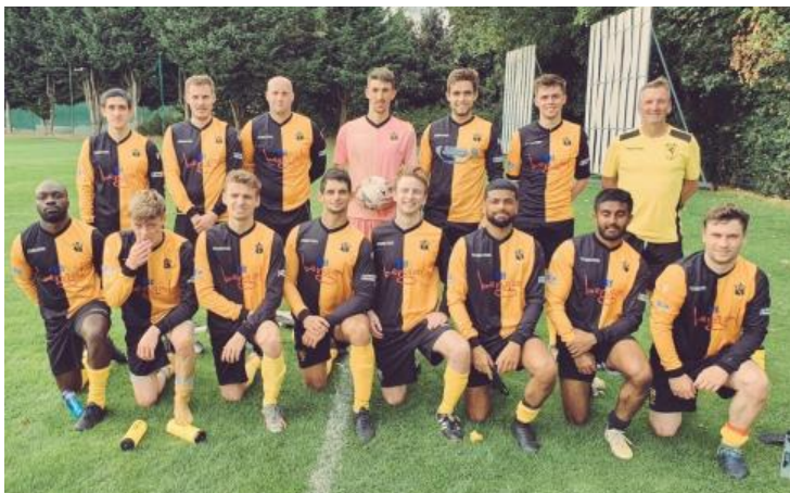
OWFC's 1st XI pictured after a successful start to their league campaign, securing a 3-0 home victory against Old Parkonians

We are also aware that not all Old Wilsonians live locally - the world has become a lot smaller since 1904 - neither do they solely wish to see their old schoolmates in a sporting environment, so we want to explore other ways of reaching out to former pupils.