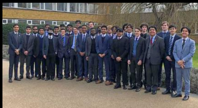
Class of 2022 offer holders - well done!

This year, we are proud to note that a record thirty-three students have been offered places at Oxford and Cambridge to study a wide variety of subjects including: Medicine, Law, Economics, History, Engineering, Geography, and Modern and Medieval Languages. Additionally, two students have been offered choral scholarships, one at St John's College, Cambridge and one at New College, Oxford.