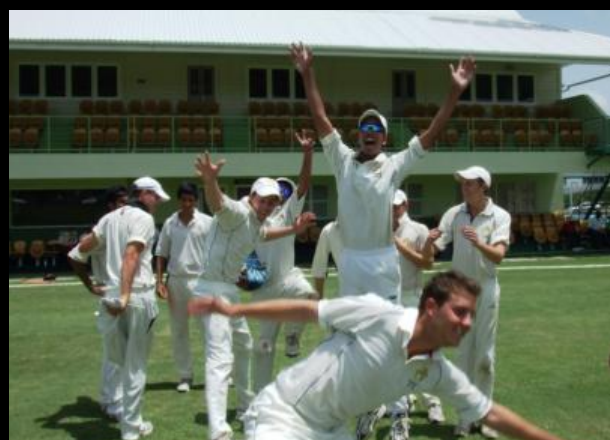
Wilson's boys and staff enjoying the sun on the 2009 Cricket Tour to Barbados!