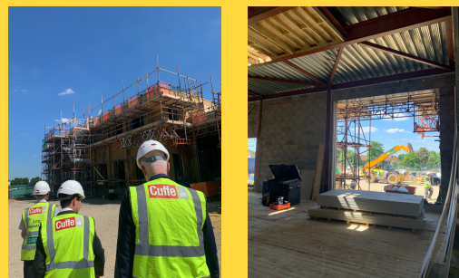
Building work continues at a pace!

On 15th June, the Headmaster and Development Team ventured on-site to explore the new build as the structure starts to take shape.