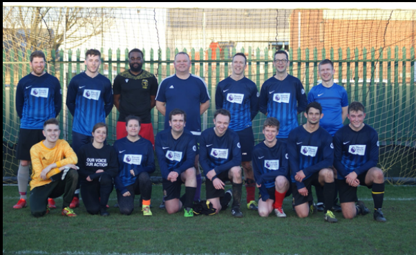
Squad photo of the Staff Team on Thursday 17th March 2022 following the 'Staff vs Students Football Match' in aid of the DEC Ukraine Humanitarian appeal. The event saw the staff record an impressive 3-1 victory, and a wonderful total of £3,816.38 raised for an important cause. A proud day for all involved - Non Sibi Sed OmniBall!