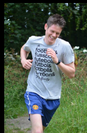
Wilson's staff help organise and take part in the Summer Parkrun at Roundshaw Downs in 2014!