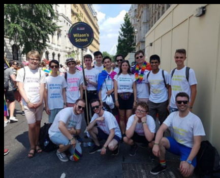
Wilson's Pride Society taking part in the London Pride Parade for the first time in 2017. The group now attends every year, representing themselves and the school!